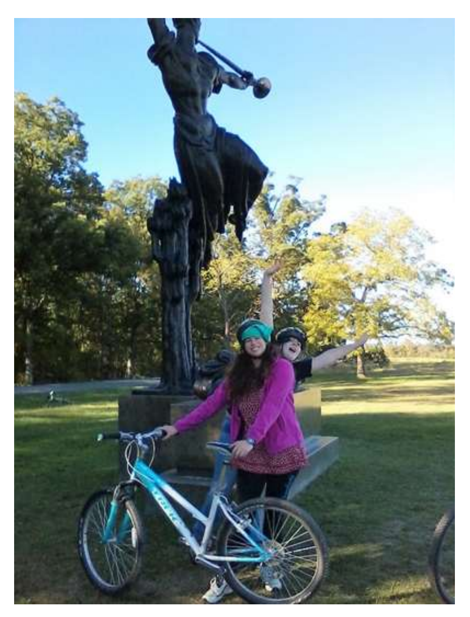
Marsh Creek Society members Going Miles For Smiles on the Gettysburg Battlefield!